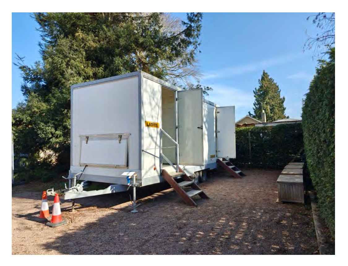
behind the Glasshouse Range.