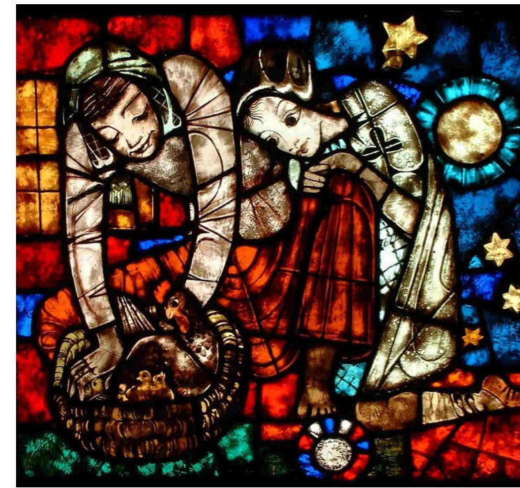
Evening, Ervin Bossanyi, 1933

This is one of two panels by the artist on the theme of morning and evening in the museum's collection. The panel shows a woman and a girl, both wearing headscarves and kneeling over a basket with hen and chickens at bottom left. There is a red background to blue sky with moon and stars.